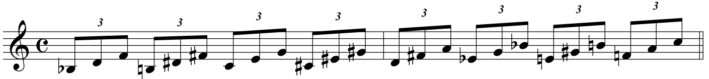
example 2 - major triads (5,3,1) up in half steps