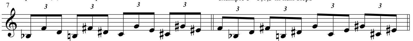
example 6 - 1,5,3(octave up)